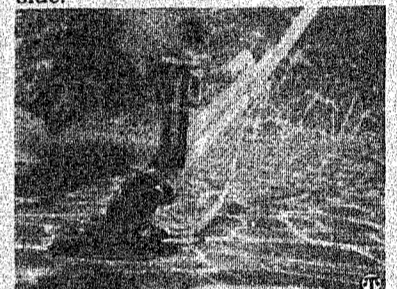
An automatic pool maintenance system helps keep your pool sparkling clean and healthy.