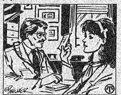
A new computer system may speed up your next doctor's visit faster.

The use of a new computer system in medical offices may mean better and faster service for patients and more productivity for physicians.