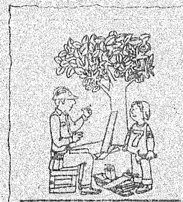
Trees are great for hiding in for building tree houses, and just for climbing. But before you start to climb a tree, be sure there are no electric wires running through the branches or touching it anywhere else. Trees are full of moisture and electricity runs through them very easily. Avoid the danger by staying away from trees near wires, and tell your friends to do the same.