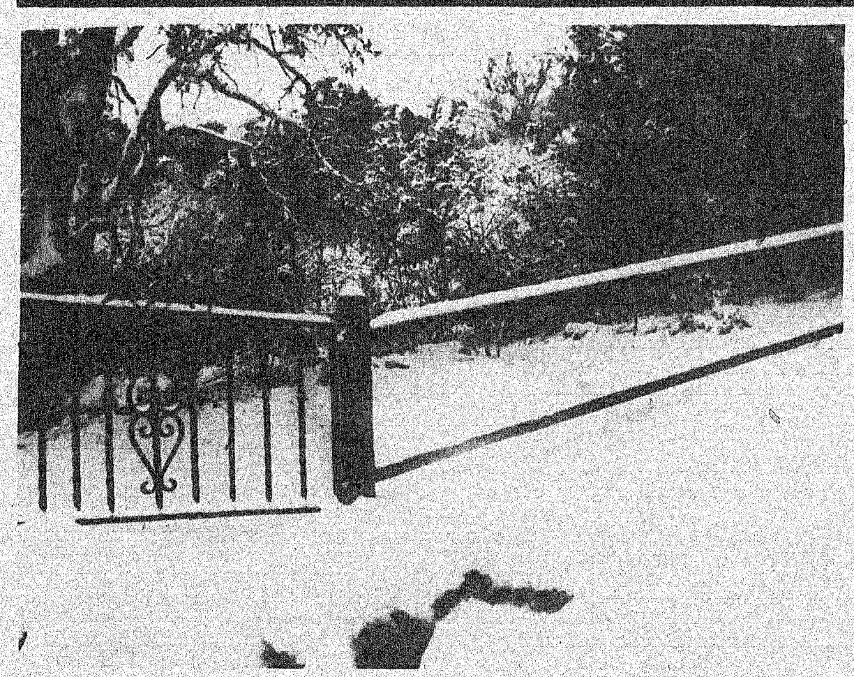
This winter wonderland scene was found in the back vard of the News editor's homeat the foot of the Santa Anna Mountain last Saturday morning after the snow