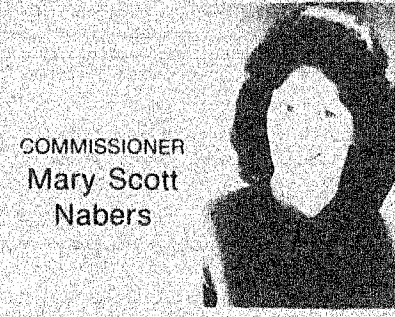
TEXAS BUSINESS TODAY

Under the proposal discussed, the 17 county road graders would still not be covered. Commissioners want them to be included in the coverage, and asked Judge Skelton to find out what that additional coverage would cost. No action was taken during the meeting but a decision will likely be made at the next meeting of the