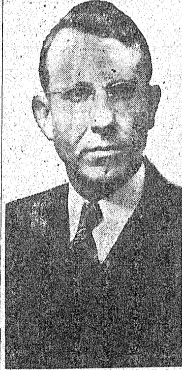
O. C. FISHER

Congressman O. C. Fisher soon after returning to his post of duties in Washington, D. C., delved into his work with some of his old time vigor and steadiness. The Congressman was laid up in a San Angelo hospital three and one-half months, because of an automobile injury January 8, until the last week in April, when he was released to be returned to his Washington post.