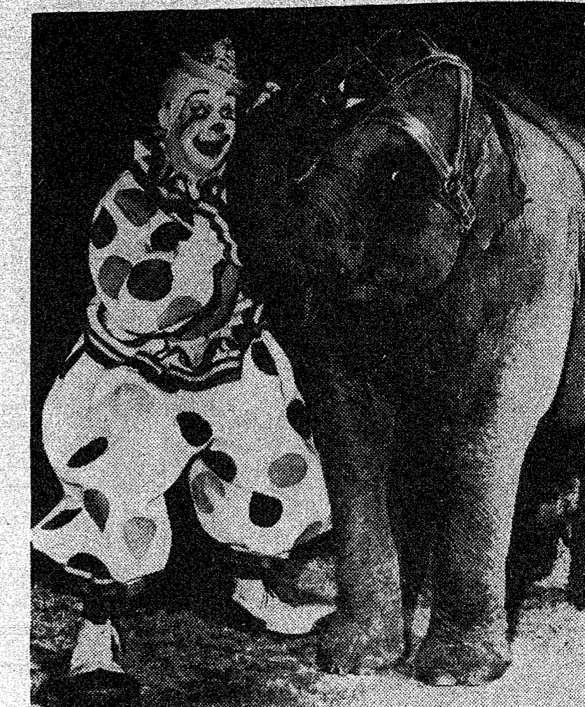
Happiness is a circus — a super spectacle where clowns and elephants, trained dogs and ponies, daring young trapeze artists and ferocious tigers create a special kind of thrill for circus fans of any age. Three rings, featuring animals, action and showmanship will be staged under the Big Top through the courtesy of Dr Pepper and the State Fair during the World Gateways Exposition in Dallas, Oct. 6-21. And it's all free!