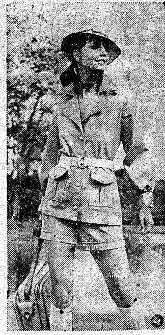
NEAT —Cotton canvas takes naturally to the crisp, tailored lines of spring's safari suit. The long-sleeved jacket is trimly belted over cuffed shorts. By Trifles.