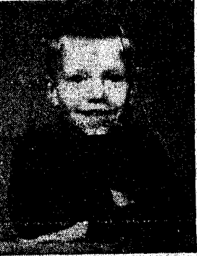
BILLY RAY RILEY