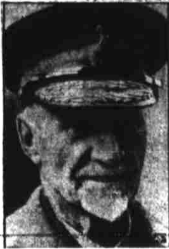
JAN CHRISTIAN SMUTS

The field marshal's physician said death resulted from a heart collapse following a cerebral embolism, or settlement of a blood clot in the brain. Pneumonia, influenza and heart strain had complicated the old fighter's condition. From around the world, expressions of sympathy poured in to the family of the field marshal—twice prime minister of the Union of South Africa, statesman, philosopher, counselor of kings, and an organizer of both the League of Nations and the United Nations. The messages reflected the ironic contrast in Smuts' varied career, which started with his leading commando raids against the British in the boer war and ended with his being a bulwark of the British Commonwealth of nations. It was Smuts who in 1917 first suggested a British Commonwealth as a part from the empire.