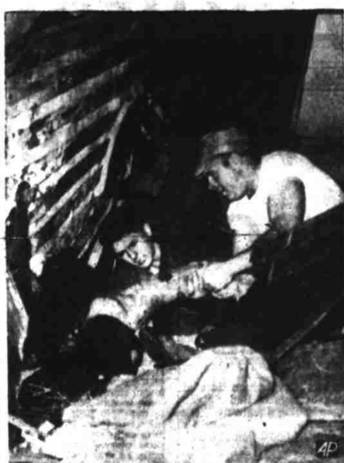
TROOP TRAIN WRECK — This is a close-up view of smashed troop train cars near West Lafayette, Ohio. Thirty-two persons were killed when the Pennsylvania Railroad's "Spirit of St. Louis" ramed the rear of a stalled troop train. Most of the victims were members of the Pennsylvania National Guard on their way to Camp Atterbury, Ind. to enter the army.

WASHINGTON, Sept. 12 (AP)—The Veterans Administration appealed to defense industries today to hire disabled war veterans. The agency said in a statement that a federally-sponsored training program is at the disposal of the veterans "but they need a place to train." "Survey after survey disclosed that these men, when properly placed, proved to be at least as good workers as their able-bodied fellow employees," the agency said. "Yet today, five years after V-J Day, thousands of disabled World War II veterans everywhere still are looking just for an opportunity to prove themselves."