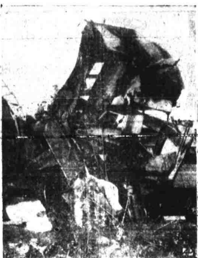
BODY REMOVED —An unidentified soldier helps a rescuer remove the body of another Pennsylvania National Guardsman killed when the Pennsylvania Railroad "Spirit of St. Louis" crashed into the rear of a troop train near West Lafayette, Ohio, thirty-two persons were killed in the wreck.