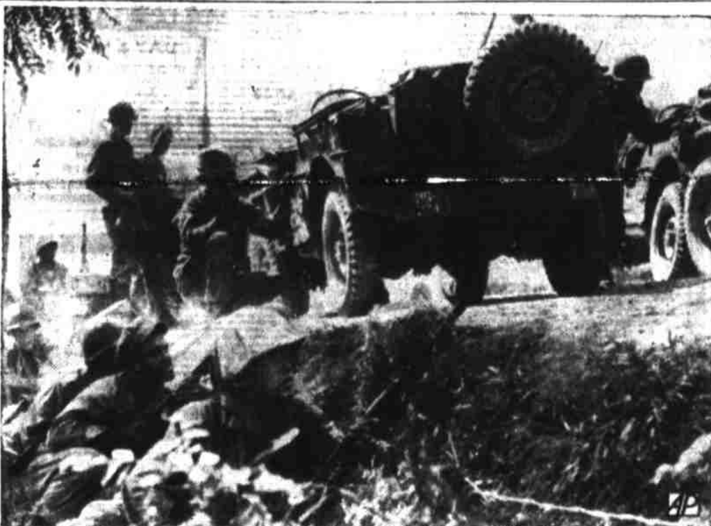
UNDER ENEMY FIRE — U. S. 25th Division soldiers are shown crouching behind a jeep under Red sniper fire as they watch American planes strafe North Korean positions on a nearby hill. This action happened in the Masan sector of the southern Korean front.