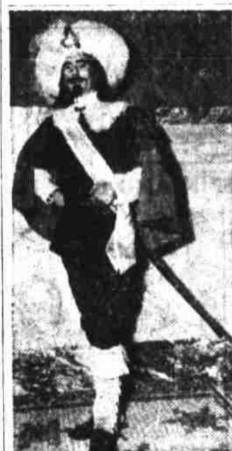
MR. CAVALIER VISITS —Tall, handsome and dressed in a costume representing one of history's romantic periods, Mr. Cavalier is a visitor in Big Spring Tuesday. He represents R. J. Reynolds Tobacco Company's new king-size cigarette, and passed out complimentary cigarettes during his tours. Among special visits, Mr. Cavalier called on patients at the Veterans Administration hospital, and gave them all smokes.