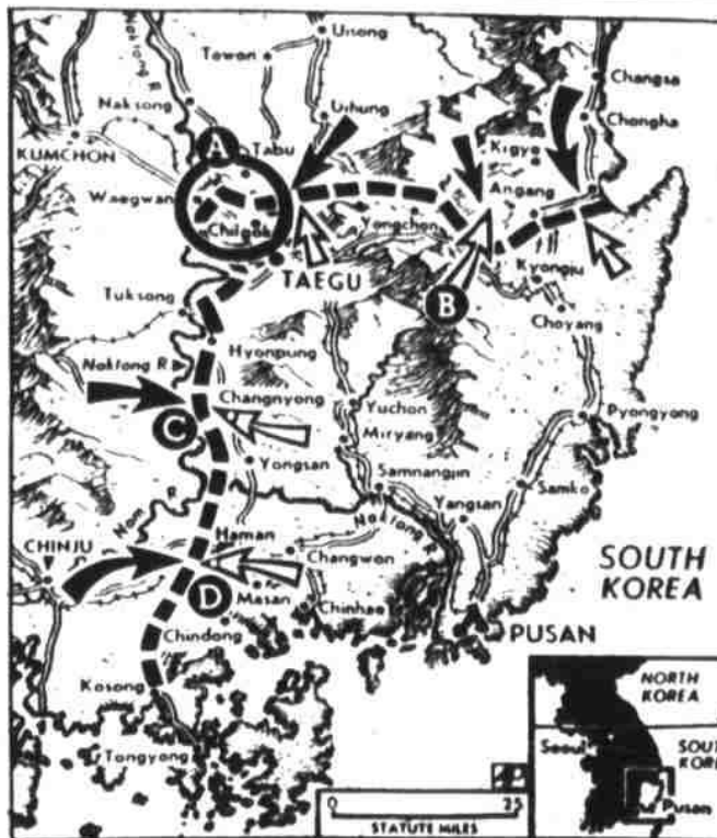
GUN DUEL HIGHLIGHTS KOREAN FIGHTING. In the circled area on hill approaches to Taegu (A) a big gun duel was in progress with American artillery credited with knocking out a large number of North Korean field pieces.

By The Associated Press Northern front. Yank first cavalrymen storm and capture strategic hill eight miles north of Taegu. Secret U. S. task force plunges ahead on eastern sector west of Pohang in move to trap 3,000 Reds.