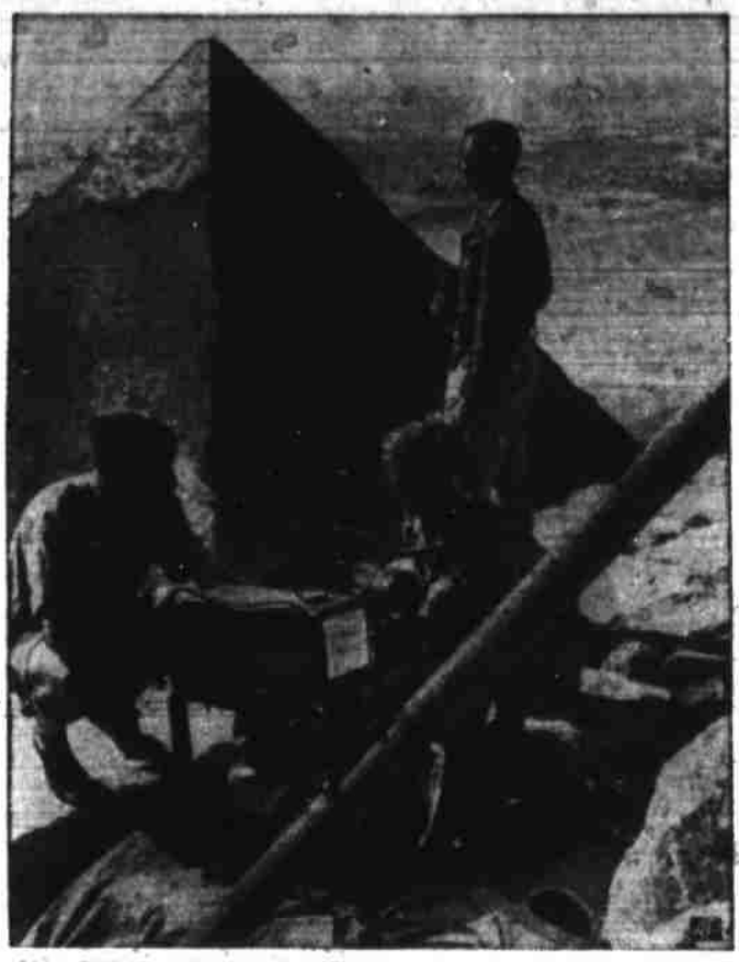
WATCH ON THE NILE —Radio observation post set up by the RAF atop Cheops Pyramid during the Allied conferences near Cairo. All equipment had to be carried by hand to the 500-foot-high peak. In background is Chephren Pyramid.