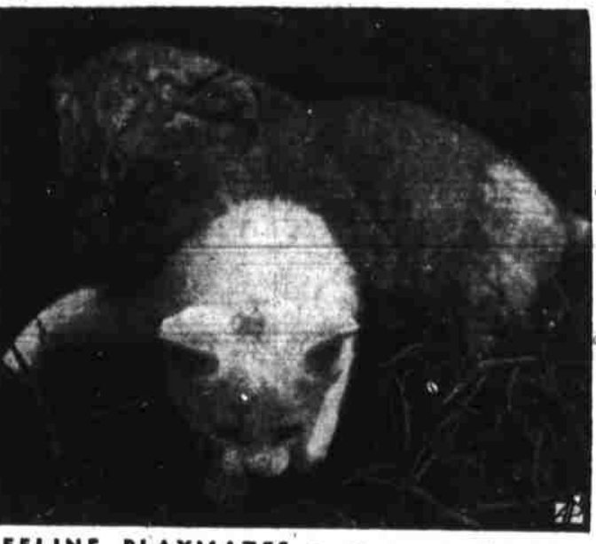
FELINE PLAYMATES —Rex, four months old lion cub, and Snowball, white Persian kitten, are being brought up together in the children's section of Taronza Park zoo, Sydney, N. S. W. Rex is still a bottle baby.