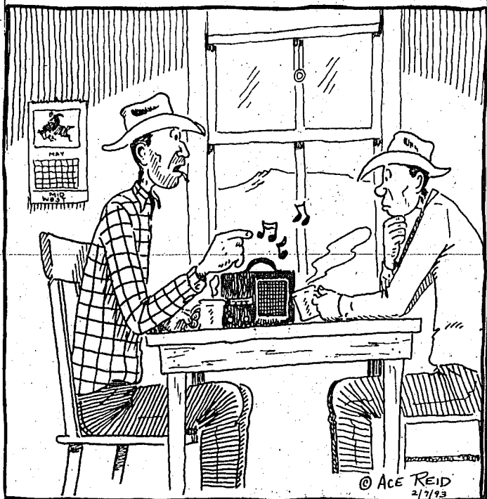
"I heard the cow market broke - but I heard it on this cheap ol' radio!"