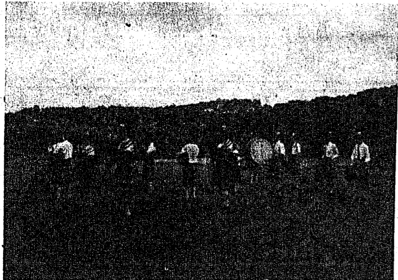
A bag pipe and drum group entertains during Mo-Ranch Days of the Scots attended by local couple near Kerrville.