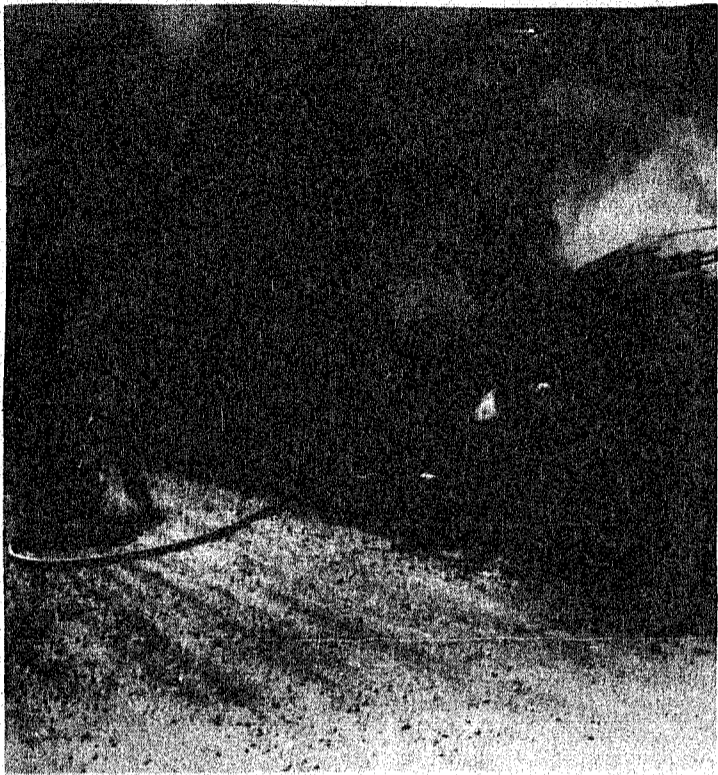
SANTA ANNA VOLUNTEER FIRE DEPARTMENT

The Santa Anna Volunteer Fire Department Associate membership drive will get under way this next week. Citizens of the community will be receiving letters detailing the drive and needs of the department, sometime during the week of April