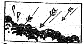
Some people believed they could make it rain by shooting arrows into the air.

Employees will hand out gifts and refreshments. Visitors will also be able to see the Co-ops power equipment up close. They can talk with the men and women who keep the power flowing. See you there!