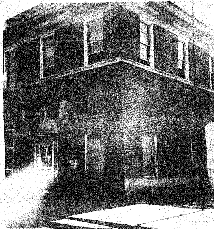
THE CITY HALL AND FIRE DEPARTMENT BUILDING received a sort of facelift this week with the replacement of windows. The project is a joint effort of the Fire Department and the City of Santa Anna.