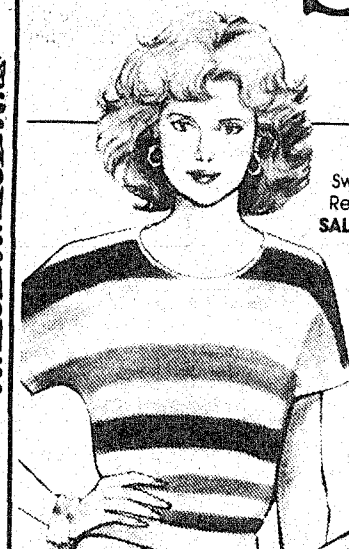
Sweater Reg. $26 SALE $19.50