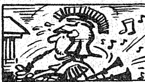
The bagpipe, regarded as the national instrument of Scotland, was used by the ancient Romans.

STARTING APRIL 9, NO CHARGING WILL BE ALLOWED IN THE SCHOOL CAFETERIA. PLEASE SEND MONEY WITH STUDENTS OR COME BY AND PAY FOR MEALS IN ADVANCE.