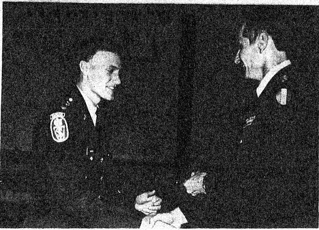
RECEIVING THE WORLD WAR II AWARD in an awards ceremony of the Reserve Officer Training