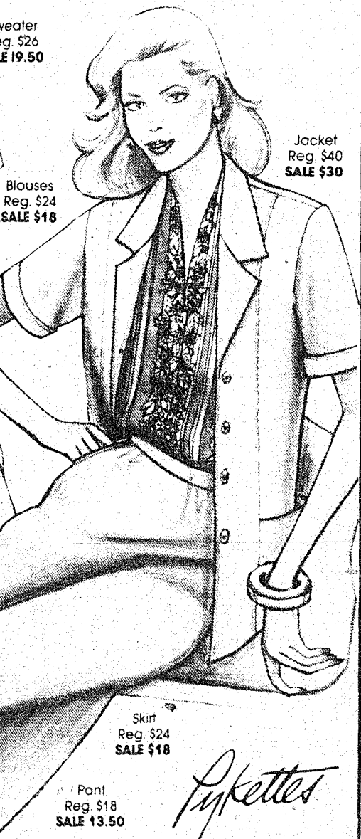
Jacket Reg. $40 SALE $30