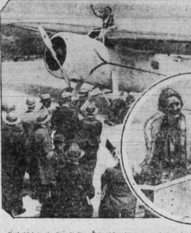
Ruth Nichols, the Ryer, N. Y., society girl and college graduate, who has made flying her business with success, is shown above (inset) conversing with her technical advisor, Clarence Chamberlin, who has accomplished the trans-Atlantic flight himself.

Ruth Nichols Poised For Trans-Atlantic Attempt