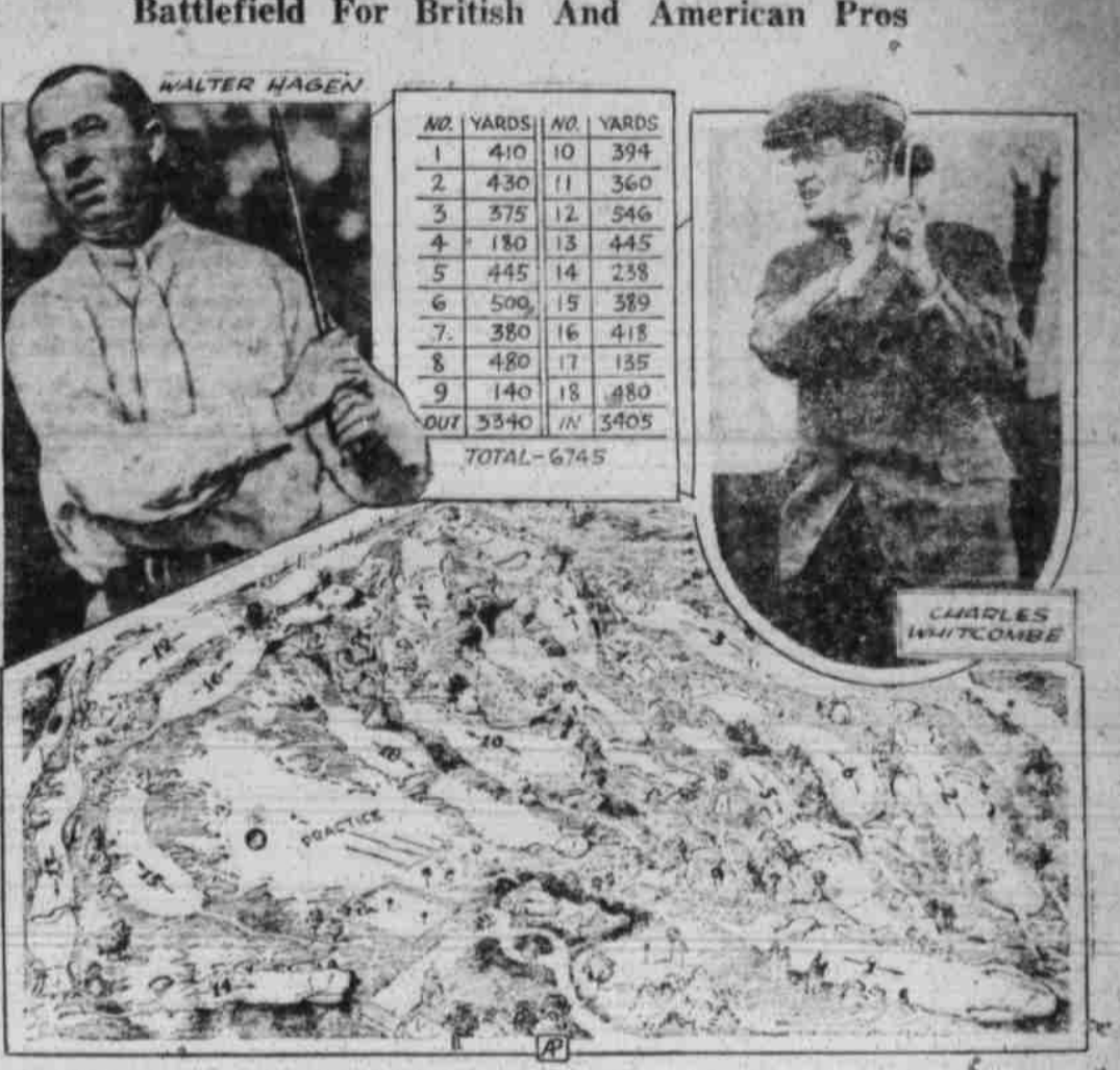
The Scioto Country club course at Columbus, Ohio, (shown in detail above), June 20-27 will be the scene of renewal of hostilities of crack American and British pros in their annual battle for the Ryder Cup. Walter Hagen, U. S. captain, and Charles Whitcombe, British leader, are shown above.