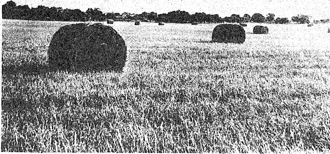
HARVEST SCENE in the central Texas area includes fields of hay, prepared for the coming winter. Large round bales are more commonly used in recent years, with long rows of the massive bales in view at many farms and