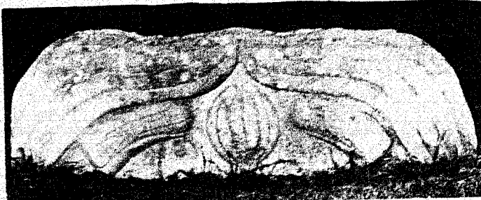
DECORATIVE STONE AT BASS HOME Harvest Design Dated 1905