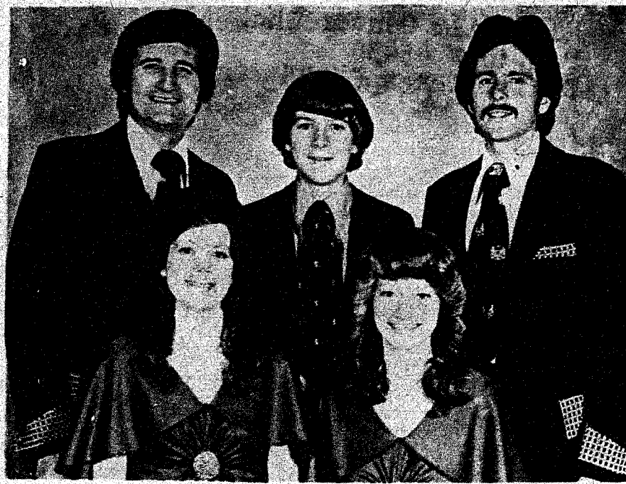
THE GOSPEL CONTINENTALS To Present Program Monday Night