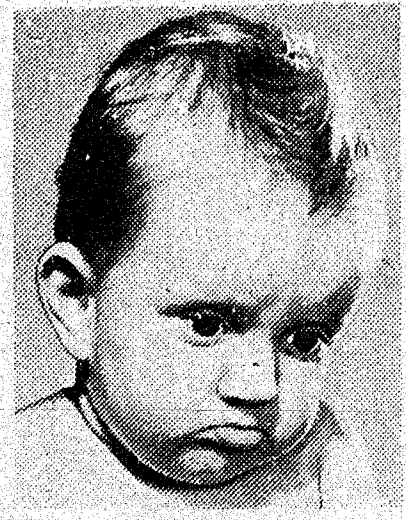
"My whole gun collection gone!"