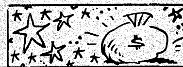
"Fortune brings in some boats that are not steer'd." Shakespeare

A liquor store sent these cards to clients and prospects: "Since you can't refrain from drinking, start a saloon in your own home. Be the only customer and you won't have to buy a license. Give your wife $55 to buy a case of whiskey. There are 240 drinks in a case. Buy your drinks from your wife at 60 cents each and in 12 days, when the case is gone, your wife will have $89 and the $55 to buy another case. If you live 10 years, continuing to buy whiskey from your wife, and die in your boots, your widow will have $27,085.47 in the bank—enough to bring up the children, pay off the mortgage, marry a decent man and forget she ever knew a bum like you."