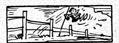
The first pole vaulter to clear the bar at 15 feet was Cornelius Warmerdam on April 13, 1940, in Berkeley, California.