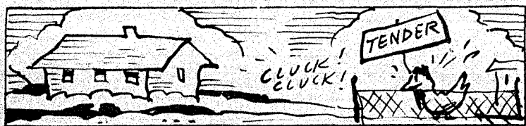
Lemon peel and lemon juice can be used to help tenderize chicken.

Grant processing and program liaison are through the Economic Opportunity Division of the Texas Department of Community Affairs.