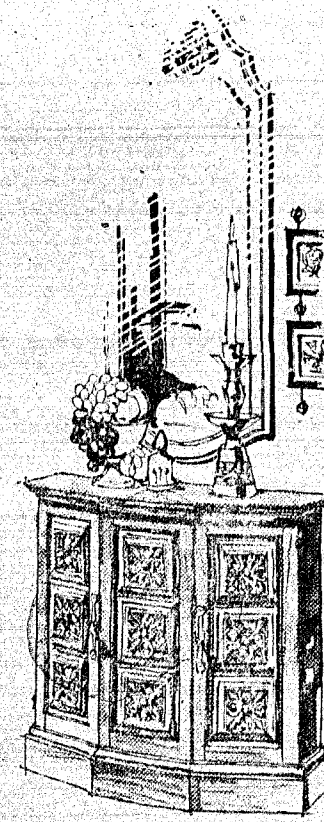
CONSOLE 68 1/2" OLD WORLD FINISH 68 7" ANTIQUE GREEN

Many Beautiful Mirrors - - $30.00 and up