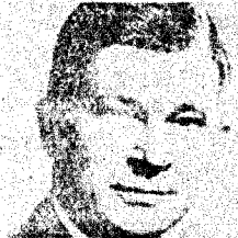
Honorable John G. Tower United States Senator from Texas Chairman, Nixon Key Issues Committee