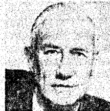
Honorable Strom Thurmond United States Senator from South Carolina Chairman, Thurmond Speaks Committee