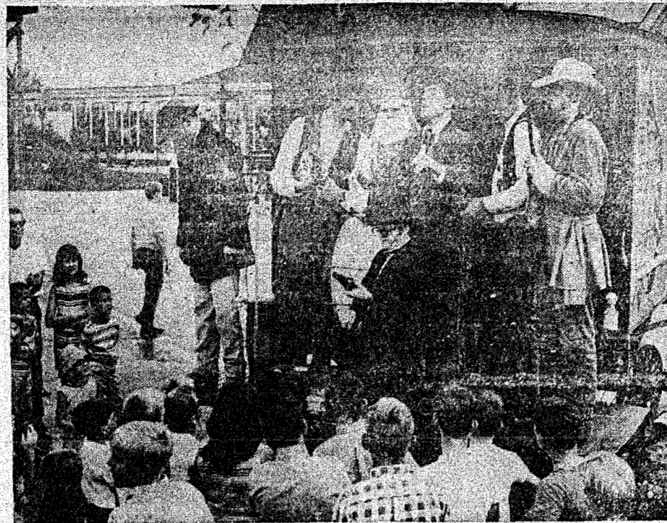
THE BIG PITCH . . . Not selling much but 15 minutes of great fun, the entire cast of the Dr. Featherflowers medicine show gets into the act in Western Junction. Astroworld is open for the rest of '68 every Friday from 6 to 11 p.m., Saturday from 10 a.m. to 11 p.m., and Sunday from 10 a.m. to 10 p.m. The price is reduced at 6 p.m. each of these days so that adults then are $3.50 and children under 12 are $2.50. Regular day price is $4.50 for adults and $3.50 for children.