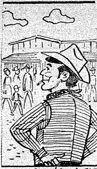
OUR TOWNS ON THE GROW. WE MIGHT BE BIG 'NOUGH TO HAVE OUR OWN VILLAGE IDDT

A relative handful of delegates walked out in protest to what they termed John Birch Society control of the party's state committee. But they were sold in their back-