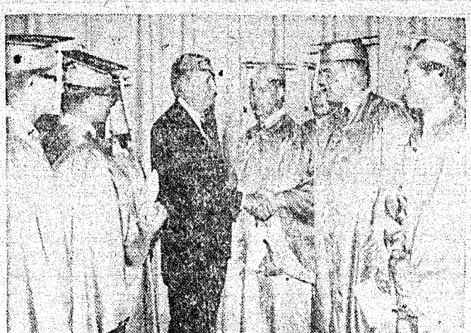
graduating class of Masonic Home High School in Fort Worth following his commencement address. The Attorney General pointed out that state expenditures for public schools have in-creased 150 per cent since 1950. He said that 46 cents of every tax dollar in Texas is spent on education. The Masonic Home and School cares for widows and needy children and grandchildren of Texas Masons.

If you want what you want when you WANTIT .. then are for you!