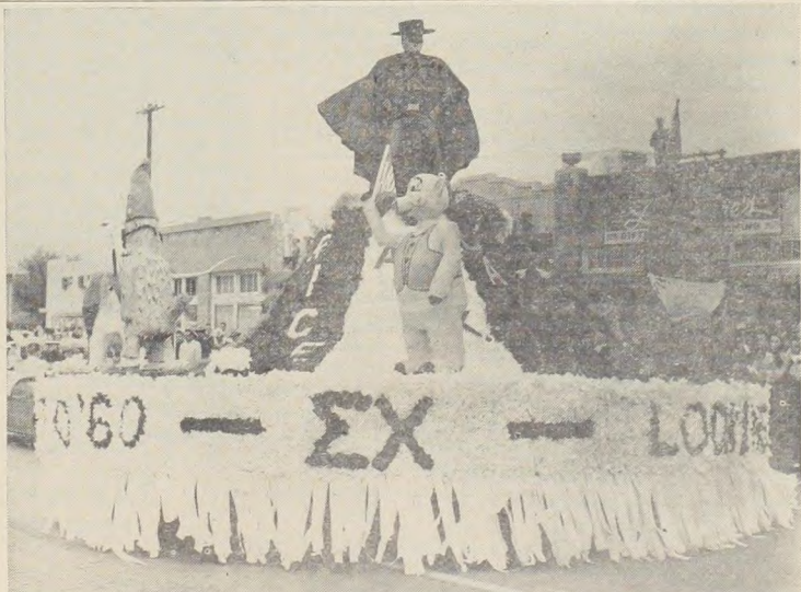
FABULOUS FLOAT—Taking both fraternity division and all-over classification first prizes, this Sigma Chi float revolved it's way down main streets of Lubbock before thousands of viewers Saturday morning. The prize winner featured paper mache

"Penny-a-Minute Night" is sponsored by the AWS twice a year. Another night when the girls won't be penalized for staying out an hour past regular hours is planned before dead week.