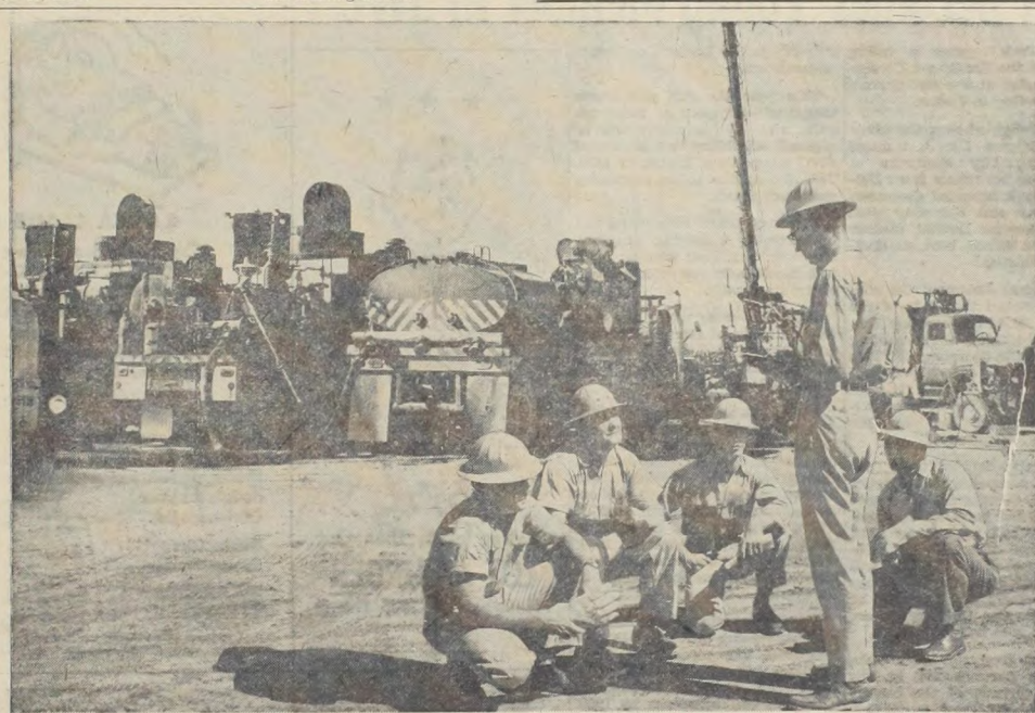
"huddle" for a safety meeting before starting a well treatment.