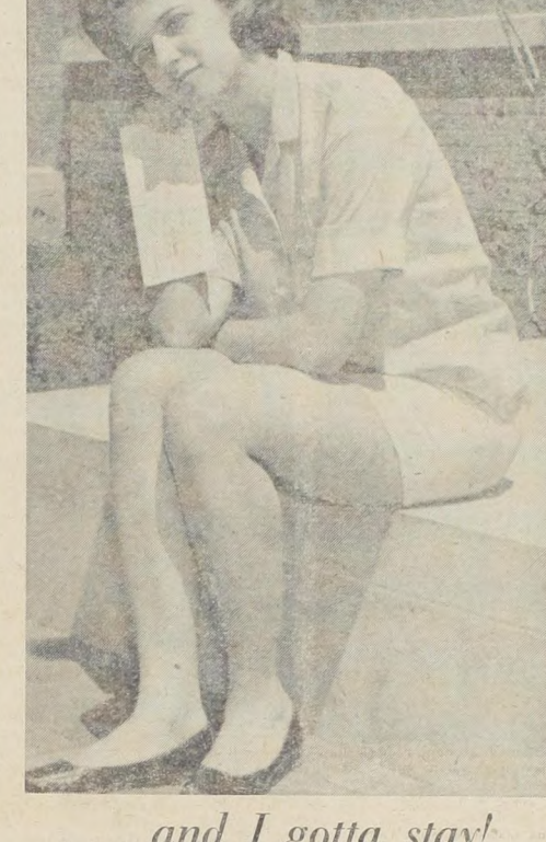
... and I gotta stay!