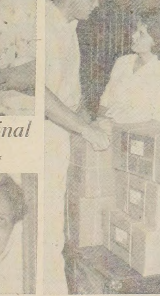
made it! sweet sorrow gang way! ... Que' sera', sera'