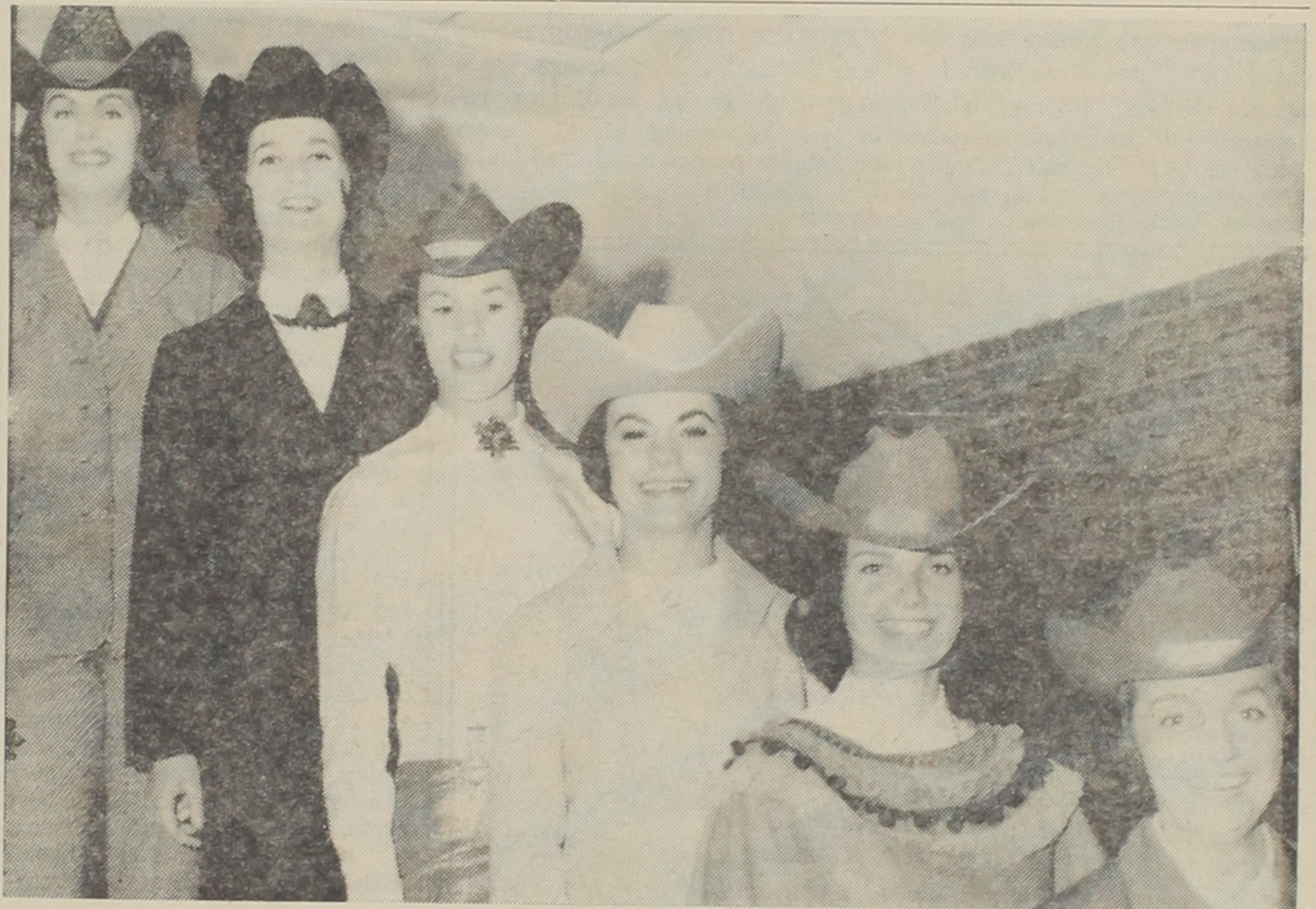
BEAUTY—WESTERN STYLE—These six Texas Tech coeds were all smiles after being picked as finalists in the Tech rodeo queen contest. The queen will reign over the annual Tech Collegiate Rodeo April 30, May 1 and 2 in the Lubbock Municipal Coliseum. From left, the finalists are Misses Ear-