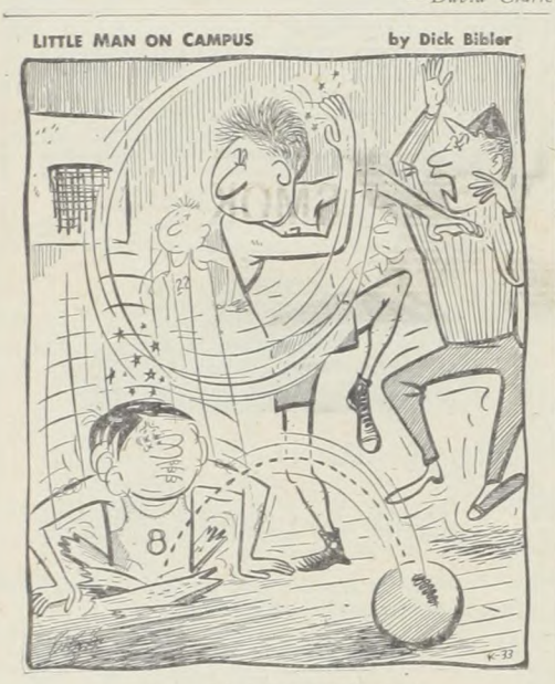
"Boy, you fouled him THAT time!"