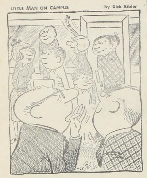
On the other hand, it's good to have a student like Worthal in class-It completes the other end of the curve.