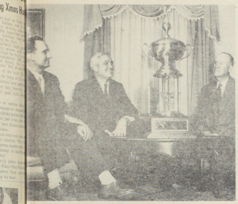
ADMIRING THE GATOR BOWL TROPHY