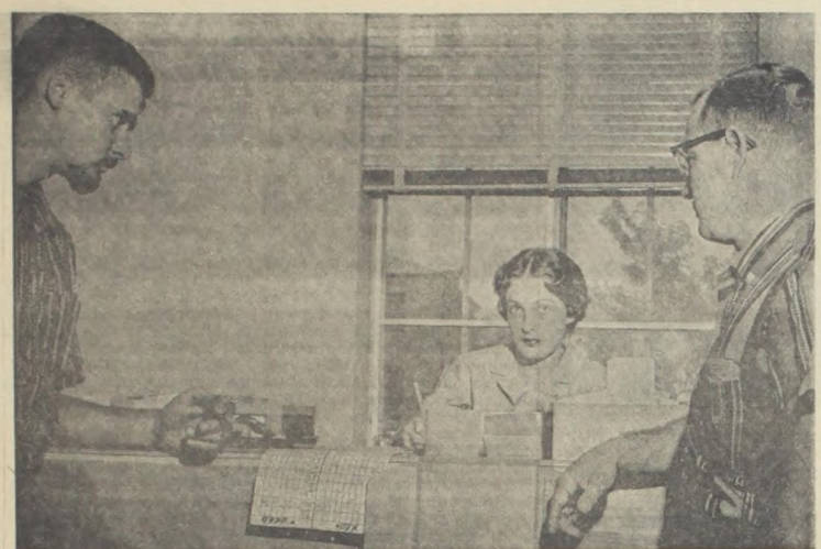
GOING THROUGH REGISTRATION for the