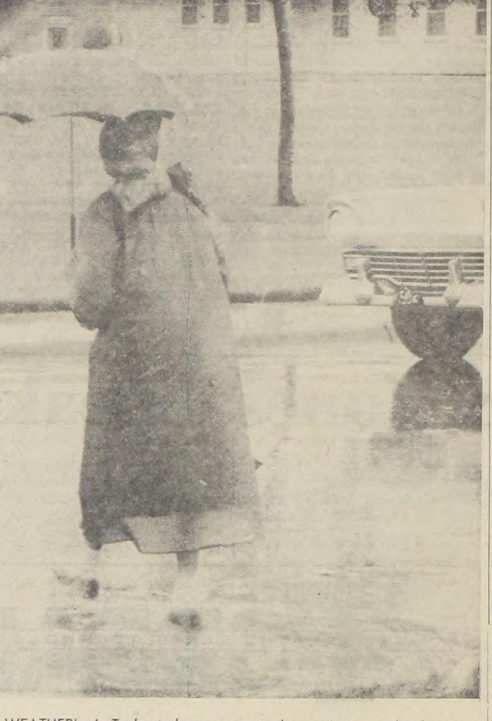
WEATHER!, A Tech student seems to be saying, as she hurries across a Tech street. This was a typical scene last week.