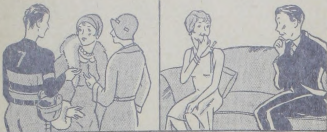
A gain with the ladies in football togs but . . .