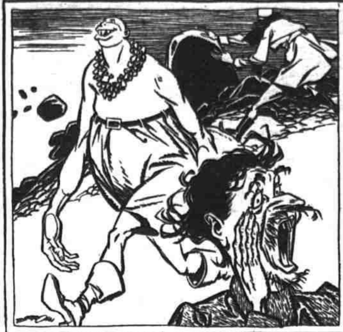
THE THREE GIANTS WERE QUITE DIFFERENT.

Then there was the giant who had a very fine voice.