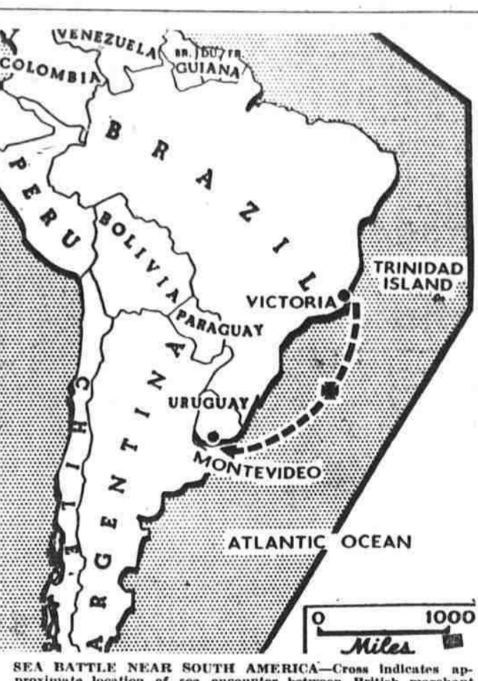
SEA BATTLE NEAR SOUTH AMERICA—Cross indicates approximate location of sea encounter between British merchant cruiser Carnarvon Castle and a German raider, as reported by informed sources at Montevideo, Uruguay.