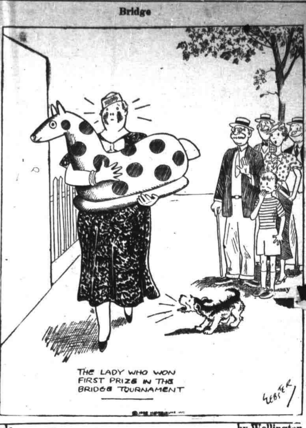
Bridge by Wellington

Lindberghs Received By Danish Rulers COPENHAGEN (AP)—Colonel and Mrs. Charles Lindbergh were received in private audience Thursday by King Christian and Queen Alexandrine at Amalienborg Castle.