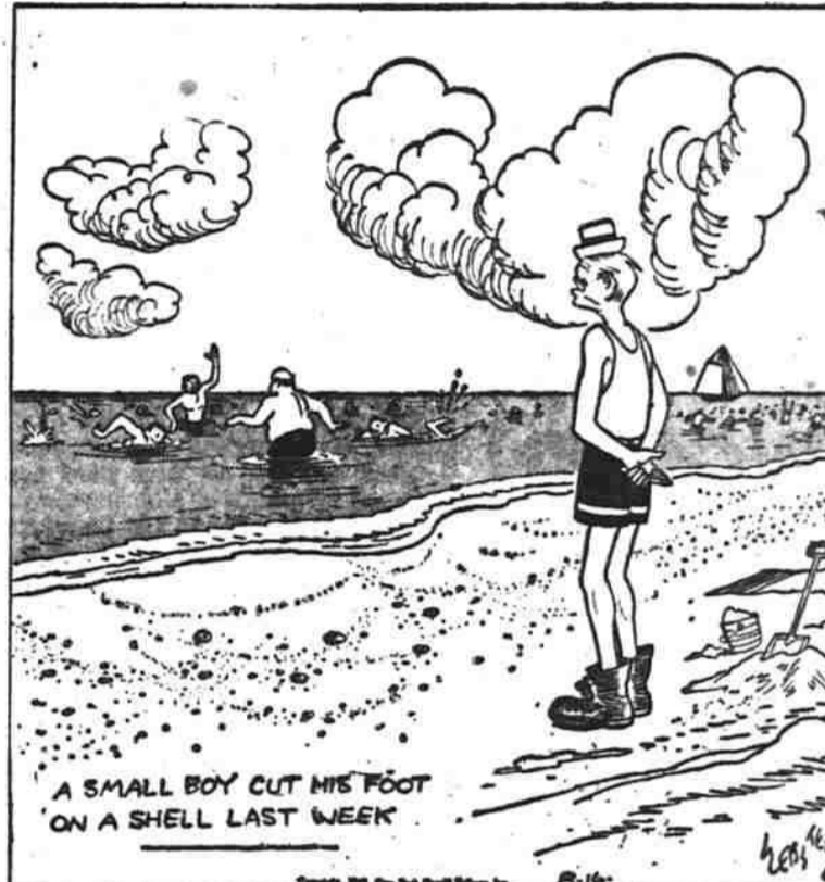
A SMALL BOY CUT HIS FOOT ON A SHELL LAST WEEK