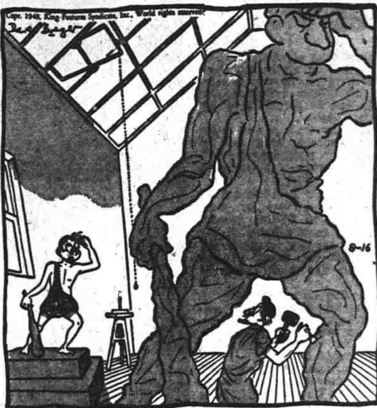
"Easy there, please—I'm ticklish right there!"