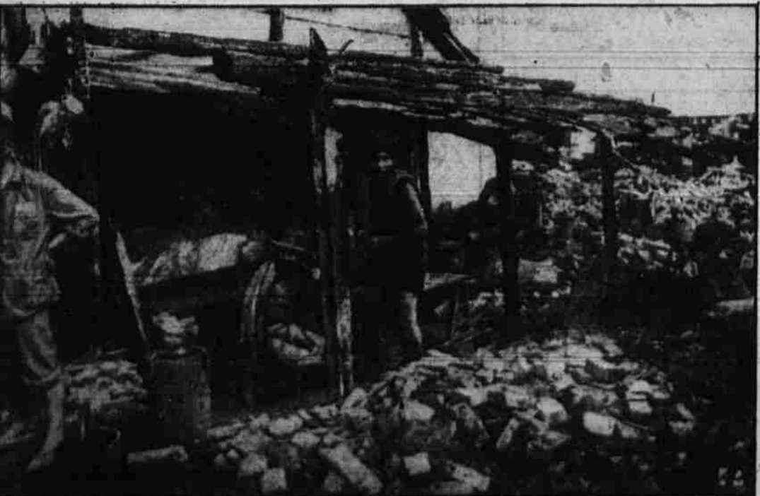
CIVILIZATION STEPS BACKWARD as war strides ahead. This was the scene of utter desolation left by a series of Japanese bombing raids on the Nantao "slums" of Shanghai. Half-destroyed, forsaken, appearing like prehistoric cave men, these Chinese have built themselves a crude shelter amid the ruins. Charred timbers show evidence of the fire which followed the aerial attacks.