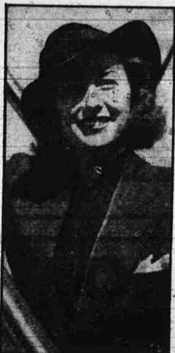
SCHOOLDAYS came bounding back to Barbara Stanwyck of the films when she visited New York. Several photographers remembered her as a Brooklyn classmate. The actress spent much of her time on the holiday denying reports she is engaged to Robert (Don't Call Me Beautiful) Taylor, now in England.