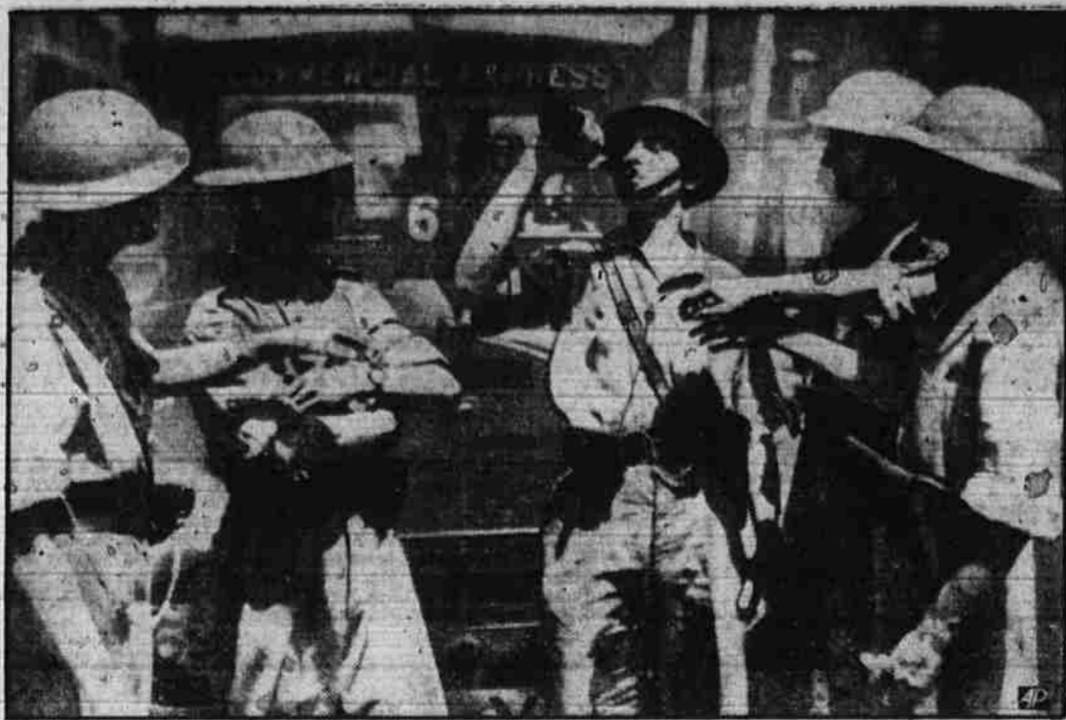
GOOD FOR WHAT 'ALES' THEM , this bottle of Chinese beer being shared by Americans and other foreign members of Shanghai's volunteer corps seems to hit the spot in late summer heat of the battle-ridden city. These workers are engaged in clearing up shell-wrecked areas, caring for wounded, assisting in evacuation of foreigners and general guard duty in international settlement.