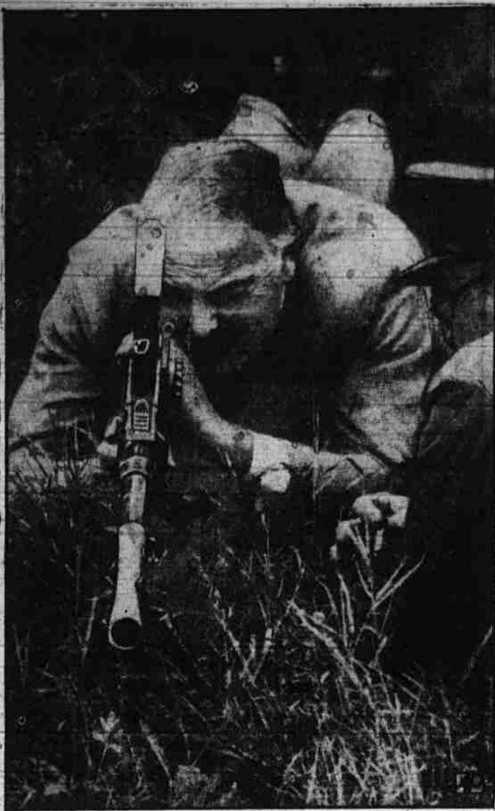
IT'S JUST A GAME , but one of deadly seriousness, that is played by Great Britain's army in its annual war maneuvers. Here is War Minister Hore-Belisha trying his hand at the new Bren machine-gun on a visit to mimic battles held in Essex, England. These war games give English Tommies the experience necessary for top fighting form.