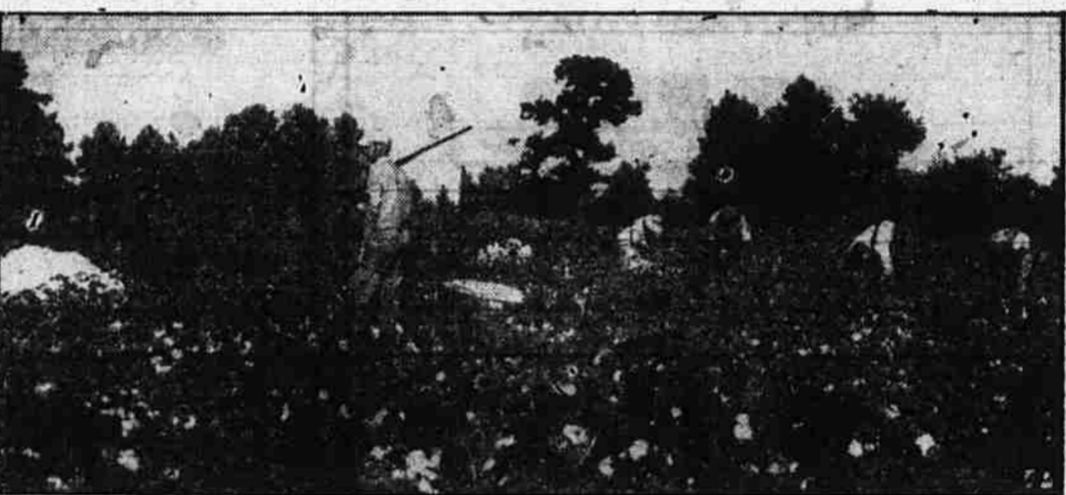
GUARDSMAN OF HARVESTERS , this Warren county, Ga., farmer stands in his cotton fields with a gun, ready to prevent any attempt of other farmers to spirit workers away owing to a "war" over labor shortage.