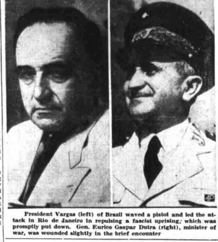
President Vargas (left) of Brazil waved a pistol and led the attack in Rio de Janeiro in repulsing a fascist uprising; which was promptly put down. Gen. Eurico Gaspar Dutra (right), minister of war, was wounded slightly in the brief encounter.