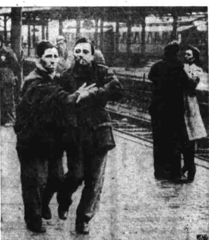
'HELP WANTED' by German farms got a response from several thousand Italian farmhands, who hurried into the Hitler kingdom to find jobs in agricultural districts. Arrival in Germany was a festive occasion for these Italians.