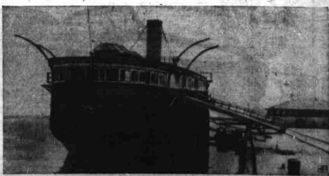
NO RELISH FOR WRECK OF RELIC, this historic frigate, Hartford, had President Roosevelt who saw the craft—Admiral Farragut's flagship during the civil war—rotting at Charleston, S. C., dock. "It looks awful; it's in horrible shape," said F. D. R. "Why don't you get a WPA project and fix it up?" He promised to see that bid for funds would "go through."