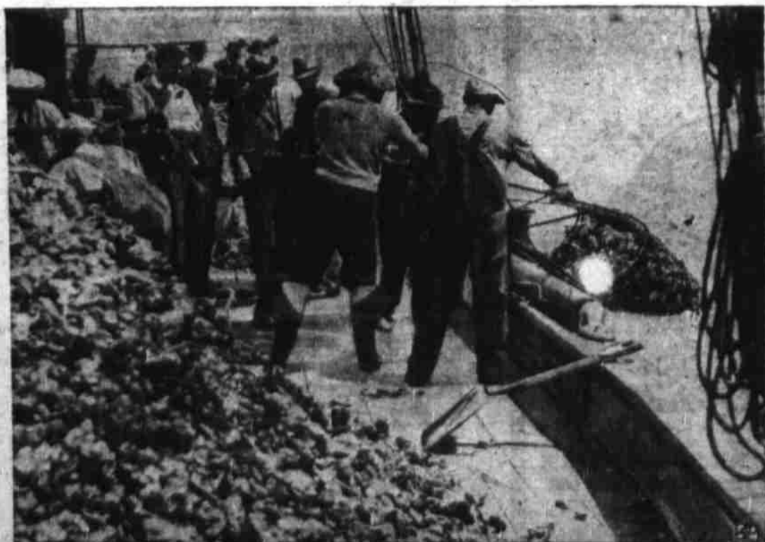
AFTER THE 'R' MONTHS, oysters retire from public life and in the quiet ease of oyster beds along the eastern seaboard, young bivalves grow. At start of planting season, oyster ships—which are built so as not to disturb young oysters—drudge oysters (above) from state-owned beds and carry them off to their private leases for transplanting.