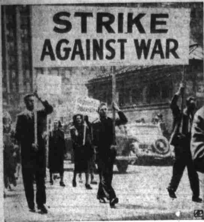
PEACE PARADE toward historic Boston Common recently enlisted shouting students under anti-war banners, as these and other college undergraduates throughout the nation demonstrated awareness of the tense military situation.