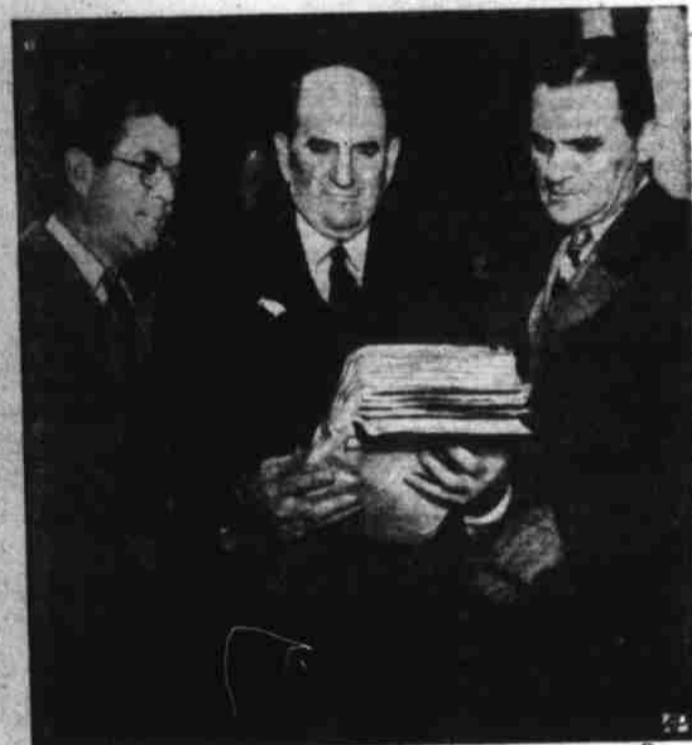
'KEEP OUT OF WAR' expressed petitions sent by Veterans of Foreign Wars to Congress where they're examined by Sen. Robert LaFollette (left), who opposed navy bill; Senators Lynn J. Frazier and Gerald F. Nye, both of North Dakota.