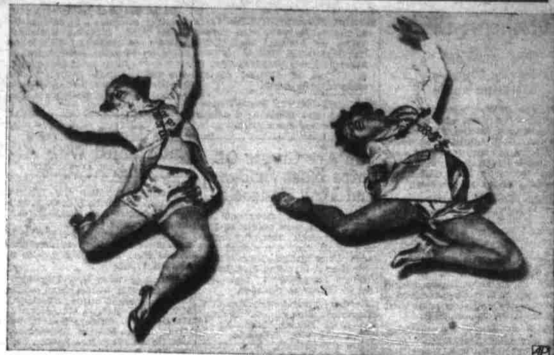
VIENNA'S LOSS WAS BERLIN'S GAIN when these two ballet dancers went from Vienna to a Berlin vaudeville theater where they were enthusiastically received.