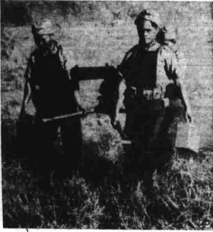
IN THE EAST with its Chinese-Japanese war, the two-year-old Philippine National army is being trained at rate of 40,000 each year, will number among its 80,000 reserve machine-gunners like these on war drill near Manila.