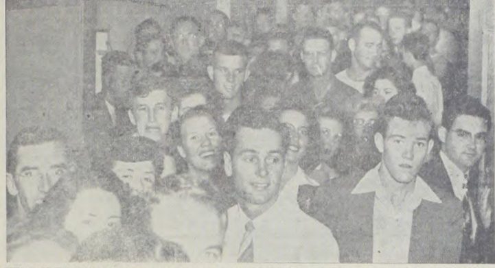
HERE IS SHOWN only one of the many mobs which students thought to be never-ending on registration days as they attempted to schedule classes and pay fees. Approximately 5,500 students have completed registration with final wind-up.