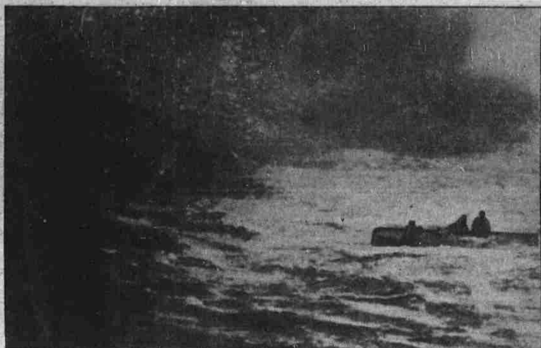
Three survivors of the "Sand Merchant" which sank in Lake Erie during a heavy storm with a loss of 19 lives, are shown as they cling to their overturned lifeboat while the rescue ship "Thunder Bay Quarries" (part of deck discernable on left) came to their aid.