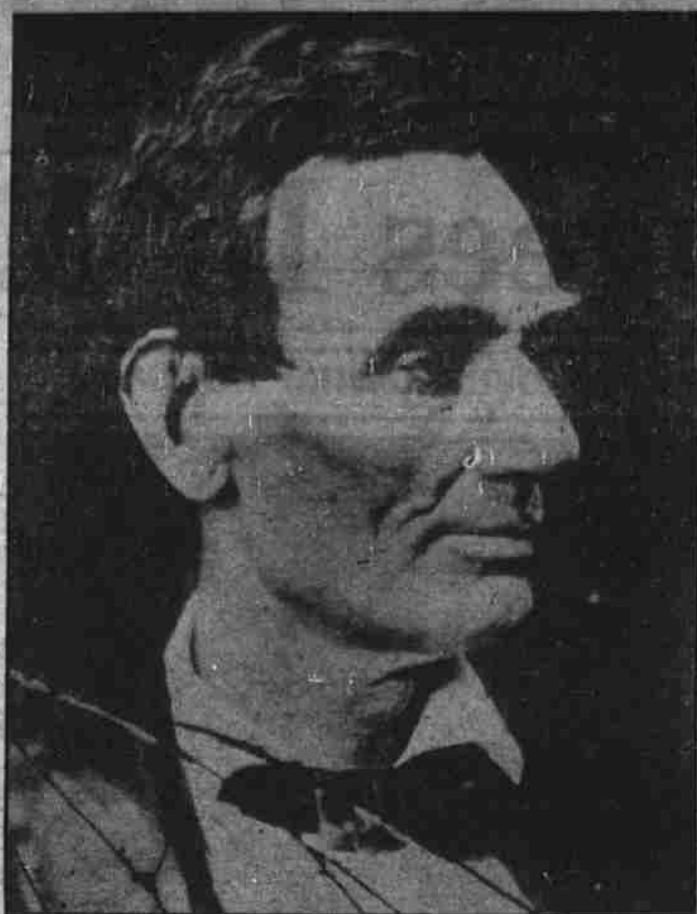
Original negatives of two photos of Abraham Lincoln, held for some time in the dead letter office of the postal department at Washington, have been added to the photographic collection of the Smithsonian Institute. Above is a picture reproduced from one of the negatives, taken in parcel post shipment, and after settlement, were retained by the post office department.