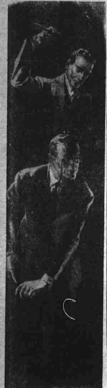
"Lawson!" Little exclaimed incredulously.

Chapter Seven MURDER Mr. Little left the room. Lawson waited. His dark eyes were glowing, and his fists were tightly clenched. All his muscles were taut with suspense. From inside the study he heard the front door open. Mahony's voice sounded in the hall. "I've brought Miss Little home. She's unconscious. But I don't think there's much wrong with her." Lawson's tensed muscles relaxed. Now he knew the worst. In the hall he heard Mr. Little's voice, hoarse and indignant. "What does this mean? What have you been doing to her? Elsie! Elsie! . . . What's the matter with her? Has she been hurt?"