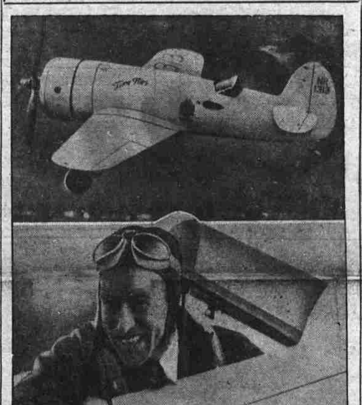
Col. Frank Hawks, noted speed pilot, is shown (below) in the cockpit of his new mystery plane which he tested at Springfield, Mass. The new ship, designed to make almost 400 miles an hour, is shown in flight (above). Construction details are a secret.