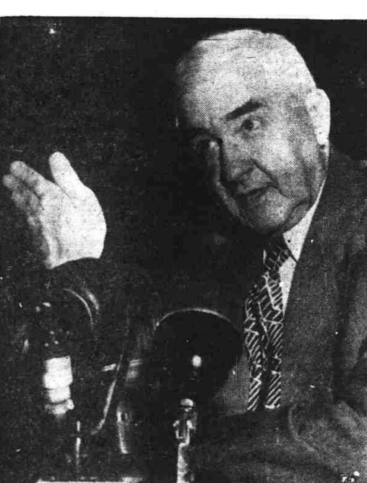
JONES TESTIFIES—Jesse Jones, former Secretary of Commerce testified before a Senate subcommittee in Washington that the late President Roosevelt ordered that work continue on a $200,000,000 flying boat ordered during the war from Howard Hughes.