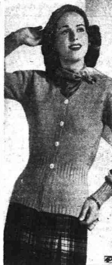
SWEATER COAT . . . Practical style in simulated handknit, with oval neck and ribbed fitted waistline.

DEMONSTRATIONS WILL BE GIVEN EVERY AFTERNOON THIS WEEK AT 2:30 ON WASHING — DRYING — IRONING USING BENDIX EQUIPMENT You are cordially invited to attend BIG SPRING HARDWARE