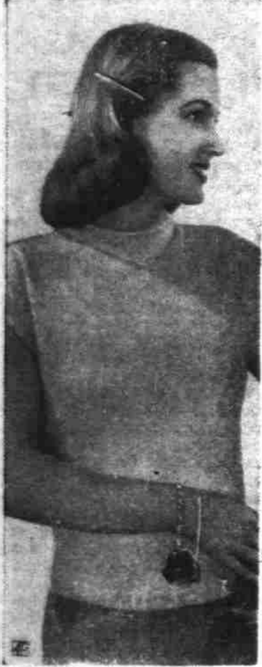
SUIT SWEATER . . . New pointed turn-down collar, short cap cleaves highlight this pastel angora sweater.