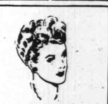
"A thing of beauty is a joy forever" — and since my lady's personal appearance comes in this classification — let us help YOU enhance your attractiveness!

Republican congressional candidates will be nominated at district conventions.