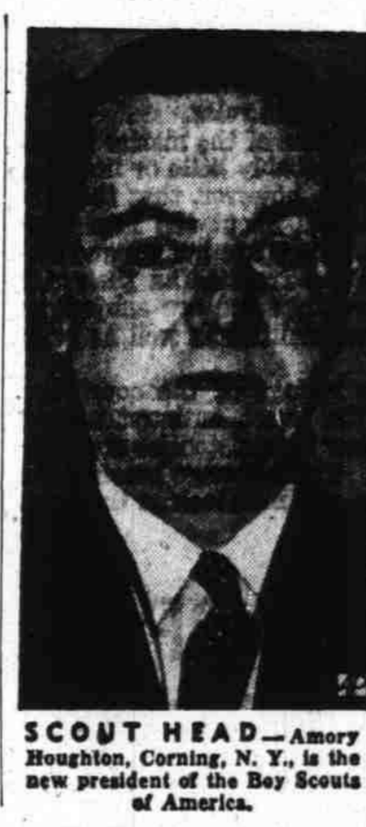
SCOUT HEAD — Amory Houghton, Corning, N. Y., is the new president of the Boy Scouts of America.

them on a baking pan. Brush with melted fat, and broil about 3 inches from the source of heat until lightly browned, about 3 to 5 minutes. Turn and broil on the other side until lightly browned also, again about 3 to 5 minutes. Crisped carrot sticks and plump pimiento olives complete the plate arrangement — young daughter's imagination will give them their rightful place in the picture.