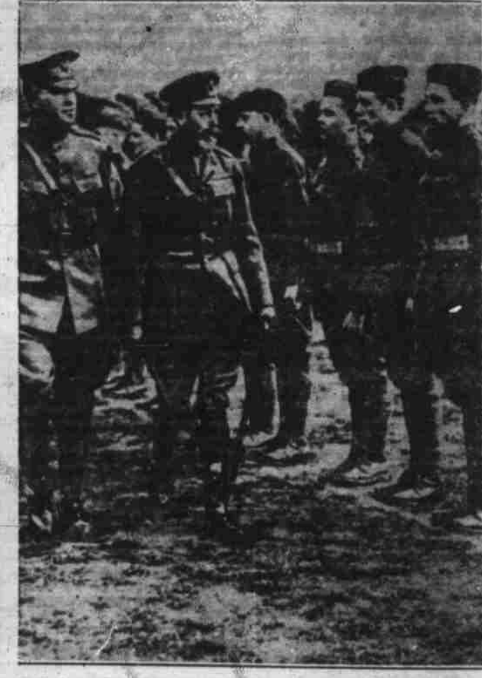
A tircless war worker, King George paid repeated visits to his troops in Belgium and France during the world conflict. This picture shows him reviewing an American tank corps in 1918.