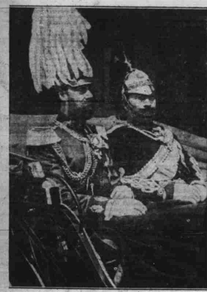
King George is shown riding through the streets of Berlin with Wilhelm, former German kaiser, in May, 1913. The British monarch visited Germany on the occasion of the marriage of Wilhelm's daughter.