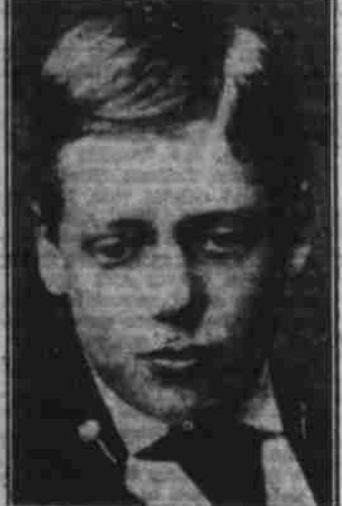
age of four and below as a navy t at the age of 12.