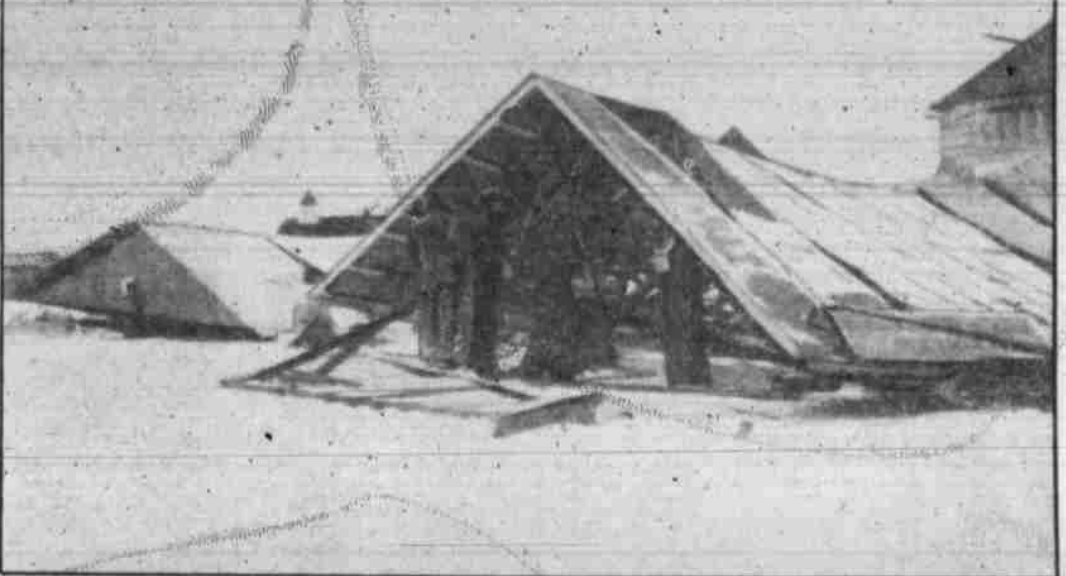
start trolleys frozen switches. The tornadoes struck sections of Georgia, Alabama and Florida, causing