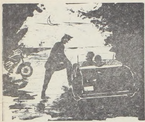
But, Officer! No one said I needed a parking tag for Aggie Grove