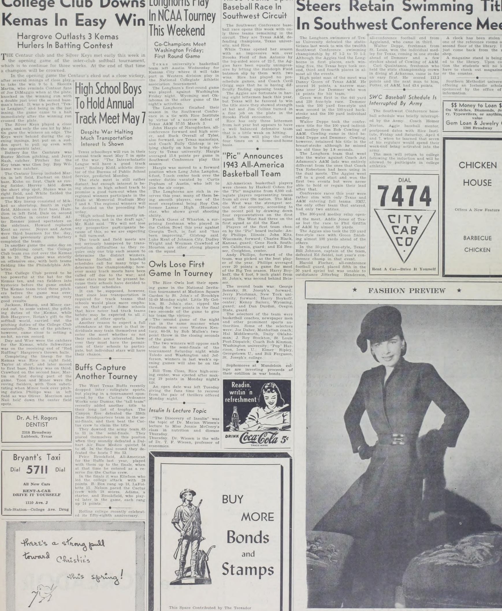
Pictured above is one of the newest styles of wearing parel among women of this nation. The ensemble pictured was published recently in Good Housekeeping Magazine