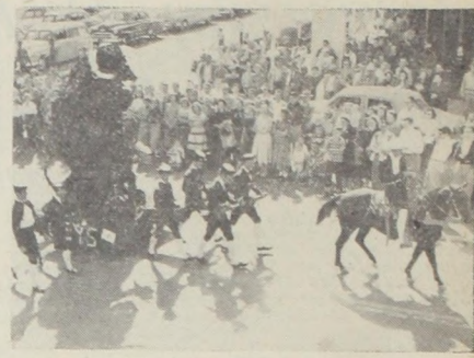
WINNERS IN LAST YEAR'S HOMECOMING PARADE included the three floats pictured above. At left is the barnyard scene entered by Block and Bridle, which was awarded a double prize: the Thomas trophy for best float in the parade and the plaque for Best Descriptive float. In the center is 1952's Most Beautiful float, entered by Ko Shari, now Pi Beta Phi. At right, the Best Comedy float was entered by Silver Key, now Phi Delta Theta.