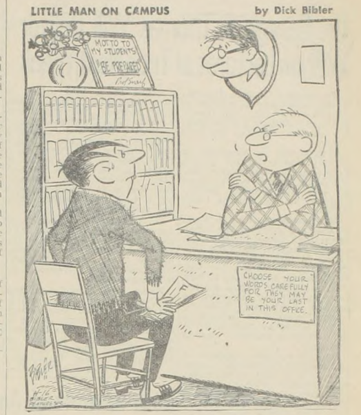
'Yes, one other time a student complained about an exam of mine . . . Now what about last Friday's test?