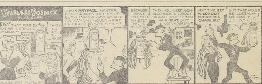
Wildroot Cream-Gil is America's favorite hair tonic. It's non-alcoholic, Contains soothing Lanolin,