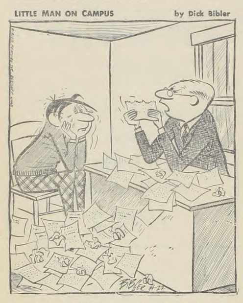
"Now that we've boiled your paper down to this relevant material, I think you're ready to re-write."