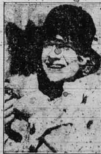
Eva Tanguay, stage star of years ago, is winning her fight for health after a long illness. She is now able to take walks from her Hollywood home with her pet dog.