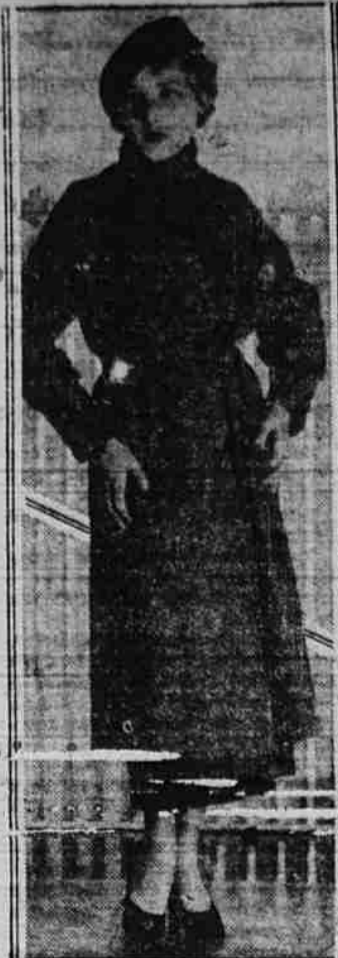
The Russian influence is seen in winter fashions. Leila Hyams wears this Cossack coat, with the cartridge pockets. The turban is of astrakhan fur.