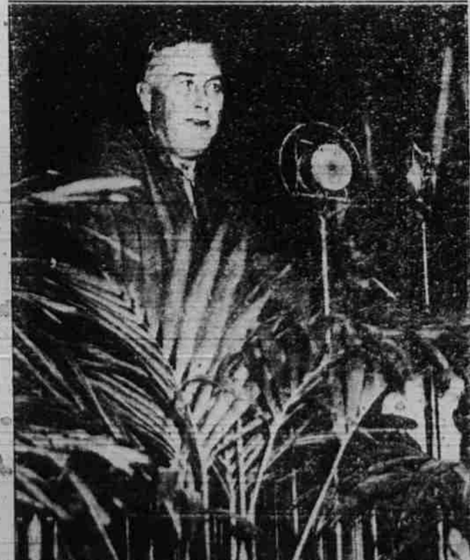
Governor Roosevelt delivered the first address of his second major campaign tour in Rochester, N. Y. He is shown speaking in the Rochester convention hall.