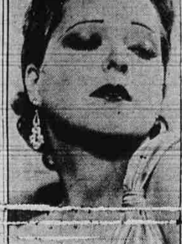
A more sophisticated Clara Bow with a new coiffure and a new head of other days. She is returning to motion pictures after a long absence.