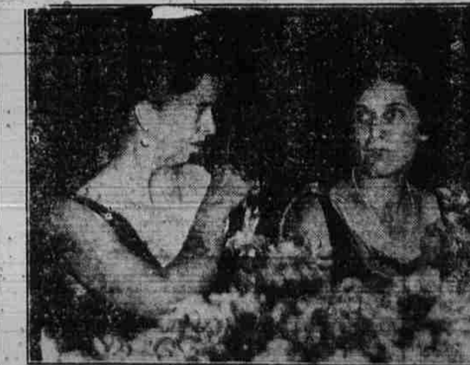
Mrs. Franklin D. Roosevelt (left), wife of the democratic presidential candidate, and Mrs. Herbert Lehman, whose husband is the democratic candidate to succeed Roosevelt as governor of New York, are shown at a reception of the King's county women's forum in New York.