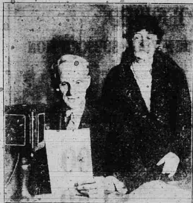
Henry Ford is shown as he spoke from Detroit, urging the reelection of President Hoover as "the best man for the job." Mrs. Ford is standing beside him.