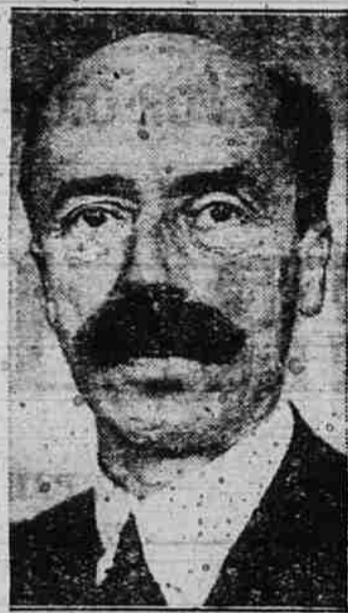
Stephen Bethlen of Hungary, former assassin of a former minister in a Budapest court, Bethlen was unharmed.