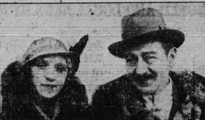
The separation of Adolphe Menjou, screen star, and his wife, known in motion pictures as Kathryn Carver, was announced by her attorney. The attorney said Miss Carver will file suit for divorce shortly. They were married in Paris in May 1928.