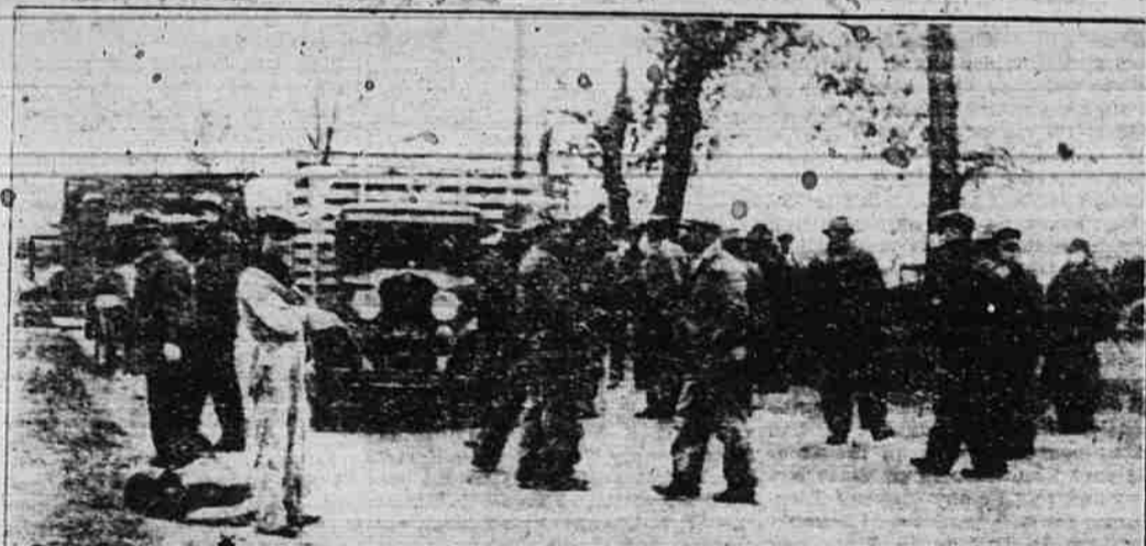
Until the Minnesota state highway patrol cleared roads near St. Paul, several highways were blocked by "striking" farmers who refused to allow produce trucks to deliver their loads. This picture shows a typical traffic snarl before patrolmen cleared the roads.