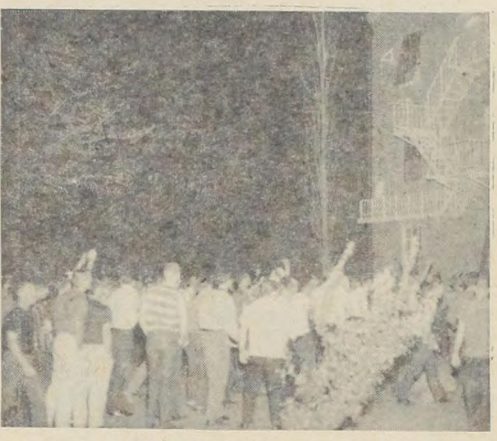
THE LADIES HAVE LATE CALLERS-Ove