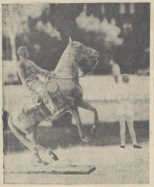
HISTORY WAS MADE YESTERDAY as the statue of Will Rogers and Soapsuds, stationary since placed on Tech's campus, reared up on its hind legs as a scrumptous Tech coed passed by. Although it is the first time anything such as this has happened, it is not startling. However, it makes one wonder what the occasion will be when Will and Soapsuds come to life and agallop away.