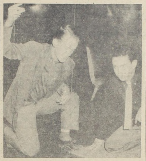
SEVEN, COME ELEVEN! Scene is a dice and