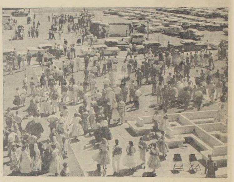
THE CONVOCATION CROWD as seen by photographer Arthur Burks